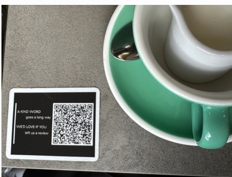
The wonderful Cooper and Straw coffee shop in Dublin where you can leave a kind word for the smiling baristas via QR code. (November 2023)