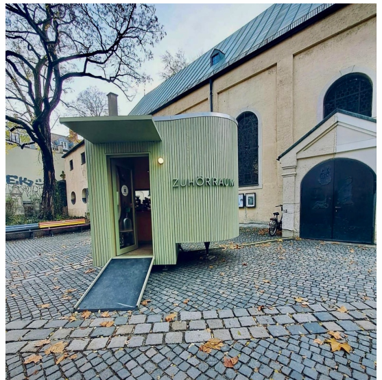
Zuhörraum in Munich: Run by momo hört zu e.V, a non-profit that promotes the culture of listening and appreciation. (October 2023)

Listening is such an important leadership skill. Often underestimated or even thought of as easy (it's not, but you can learn it!). If you are truly able to actively listen, without judgement, without interruption, the impact is powerful. When we are able to listen, human connection emerges and flourishes.