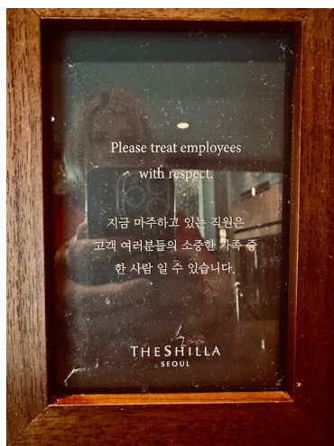
The impeccable, classy Shilla in Seoul where the staff go out of their way for each guest, myself included. Respect goes a long way. (July 2023)

With current geopolitical tensions and uncertainties, kindness should not be considered a luxury. Nor should it be considered a weakness in leadership. Kind leadership brings in all the different elements of authenticity, transparency, warmth, building trust, and empowering people. What drives engagement today? Feeling valued, respected, developed and cared for.