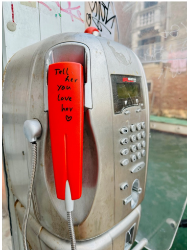
Public pay phone (yes, they still exist!) seen at a canal in Venice (September 2023)

Inspiration is often right under our nose